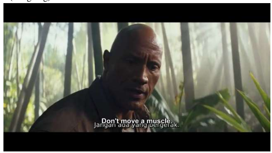
Figure 1. Scene Time (00.06.07)

these made-up stories. Nelson: (Laughing)