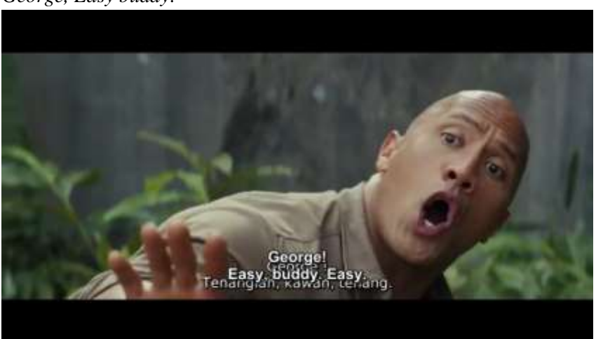
Figure 2. Scene Time (00.09.05)

Davis: Connor, Connor! Davis: George, Easy buddy.